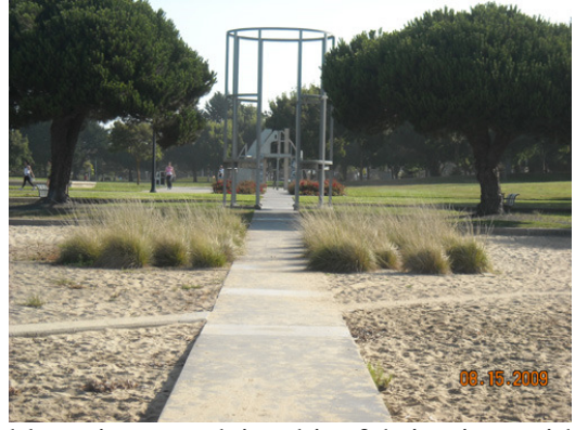
blueprints used in ship fabrication with women's memories of work in the

hull under construction and is made of stainless steel. "Image ladders" recall those used by workers to traverse the prefabricated ship parts. Etched granite pavers begin at the hull and cover the length of the keel walk, including a timeline of events on the home front and individual memories of the period. Midway is the "Ship's Stack", shaped to recall a ship's smoke stack, this structure holds a ring of panels combining